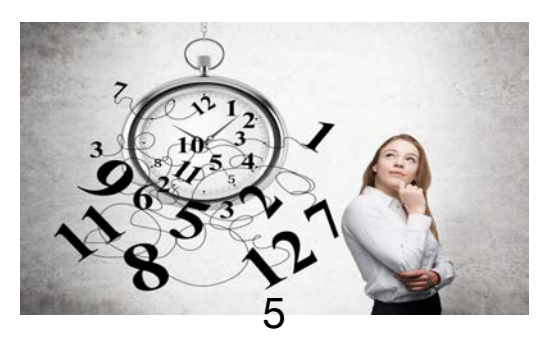
How much time are you willing to devote to your work?