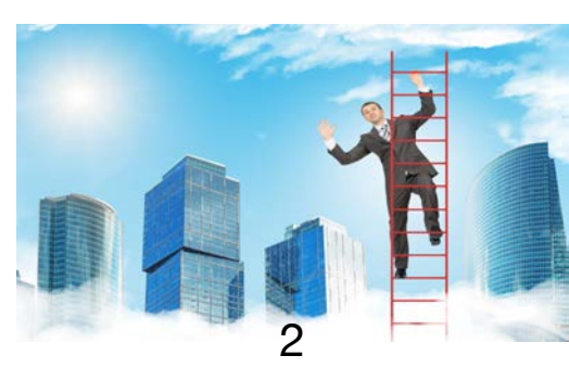
How do you plan to climb the ladder to success?