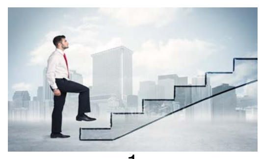
Do you expect a lot of advancement in your career?